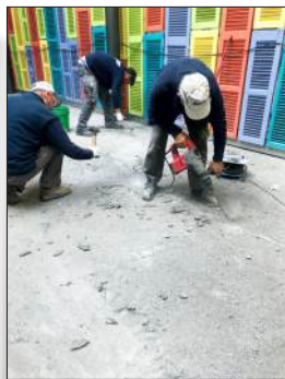
All the loose flooring material is removed