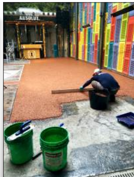
DuraFill and decorative stone is applied