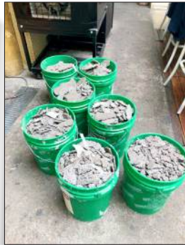
The substrate is prepared