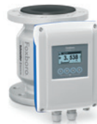
IMT31A Compact 0°-version