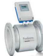
IMT31A Compact 45°-version